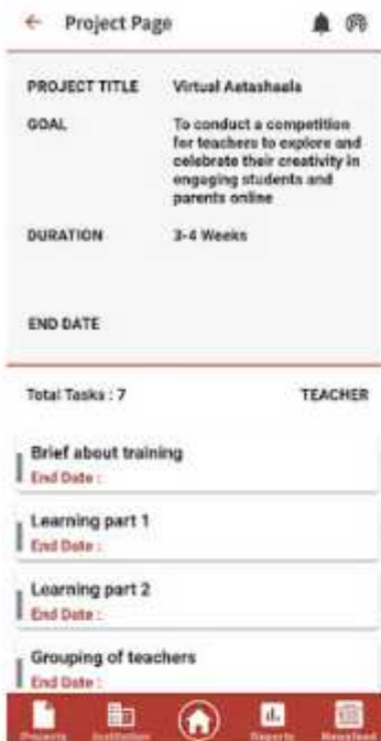
Screenshot of schools uploading their innovations on the application