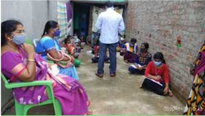
Balyogi school implementing their project called Operation Village Circle