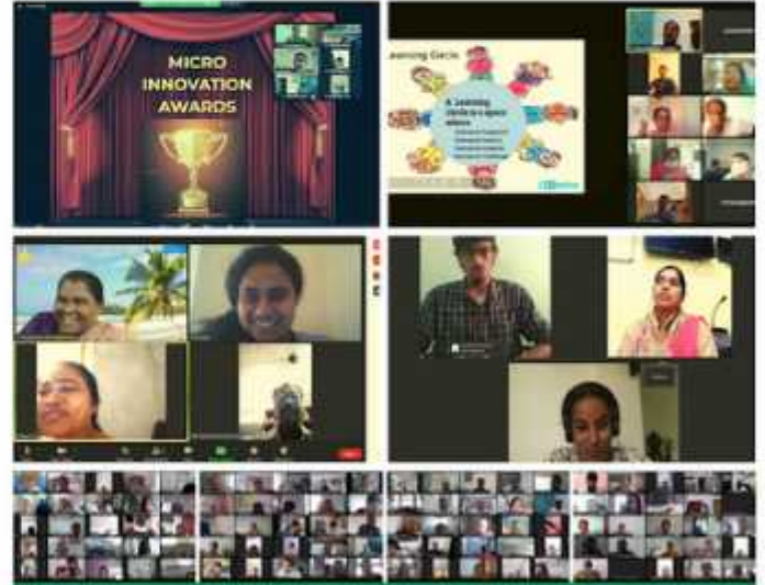
Screenshot of the main event